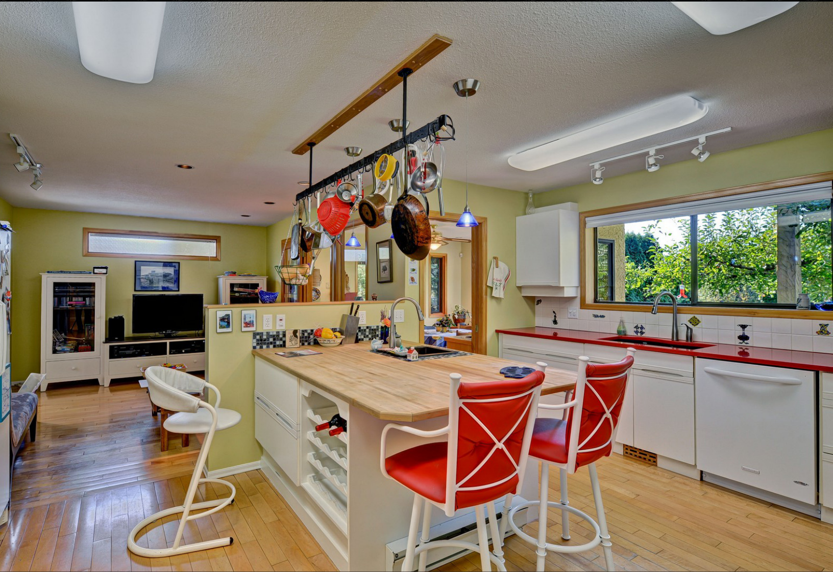
Home has a tasteful kitchen with quartz countertops