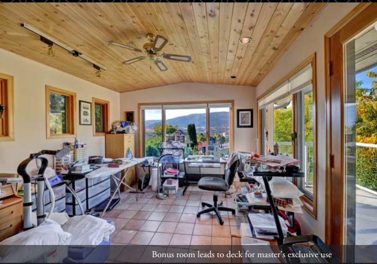
Bonus room leads to deck for master's exclusive use