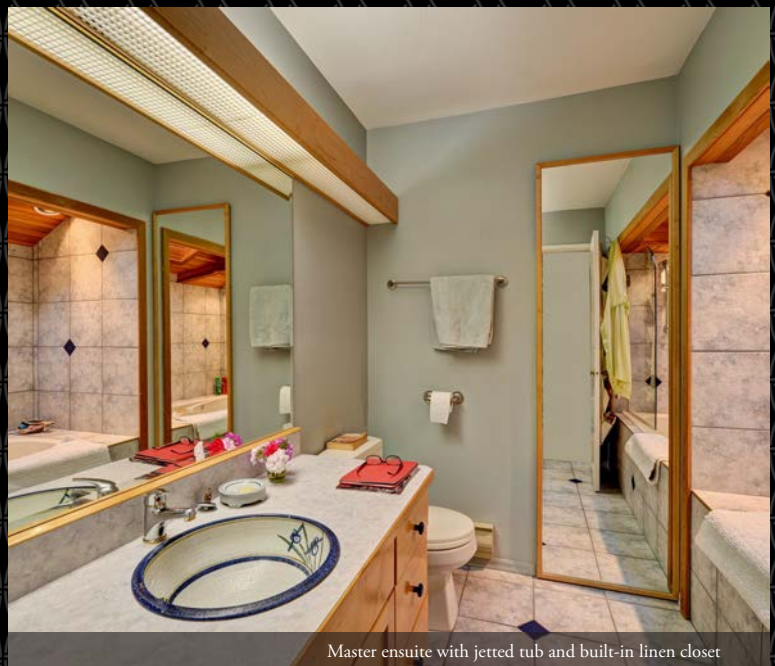
Master ensuite with jetted tub and built-in linen closet