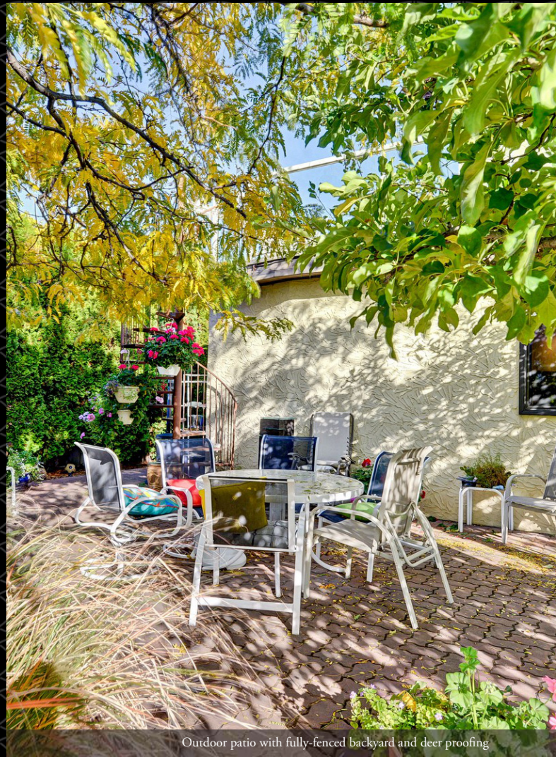
Outdoor patio with fully-fenced backyard and deer proofing