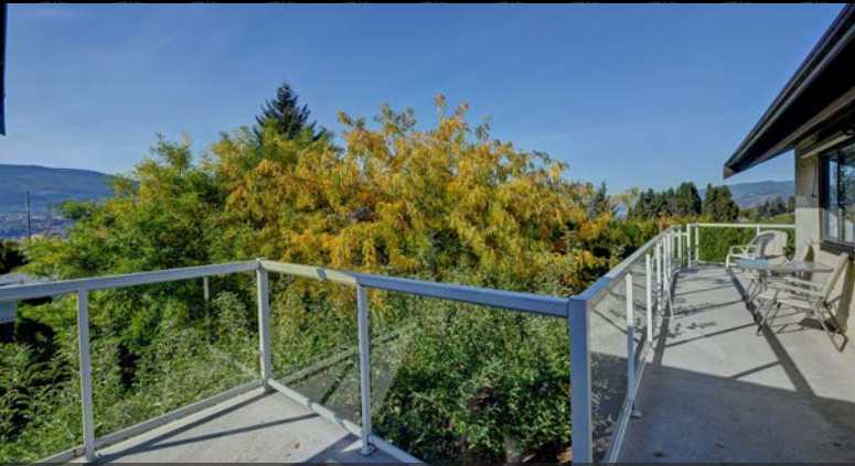
Glassed in deck has spiral staircase to private backyard