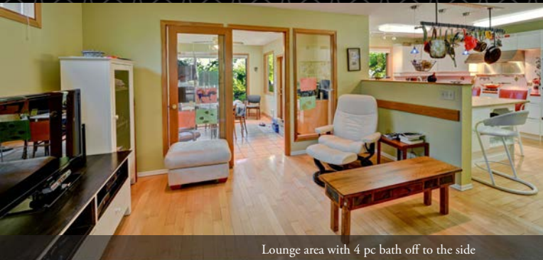
Lounge area with 4 pc bath off to the side