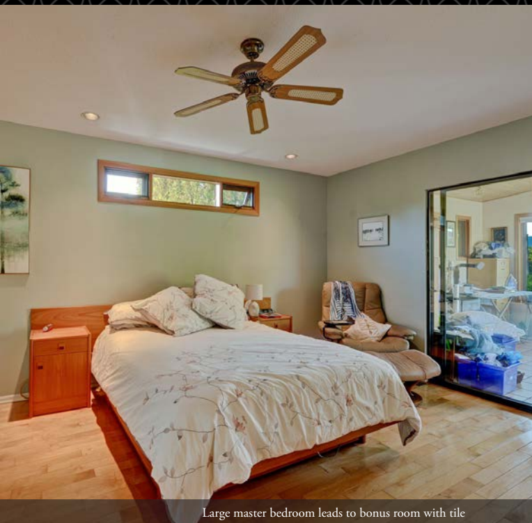
Large master bedroom leads to bonus room with tile